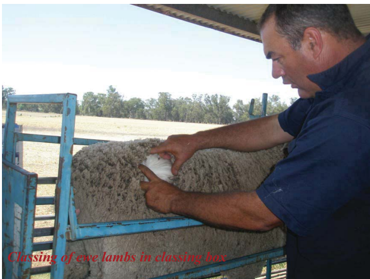
Classing of ewe lambs in classing box

Lachlan Merinos semen has been sold to studs Australia Wide, including NSW, VIC, QLD, SA, WA and also to South Africa.